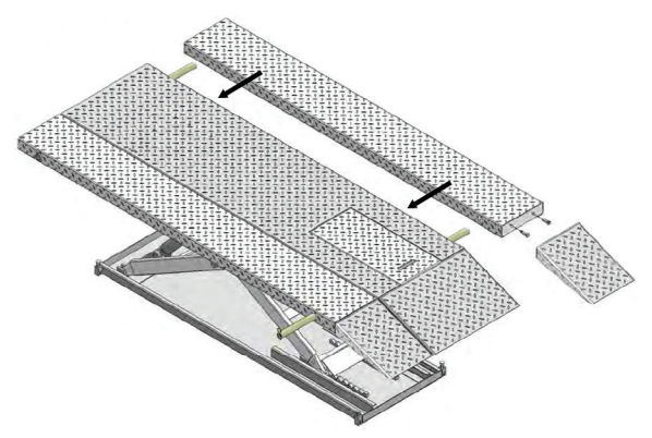
An example of Hospital Bed Maintenance Lift with the Width Extension Kit, adding 300 mm to each side.

Please note: This is an imported product.